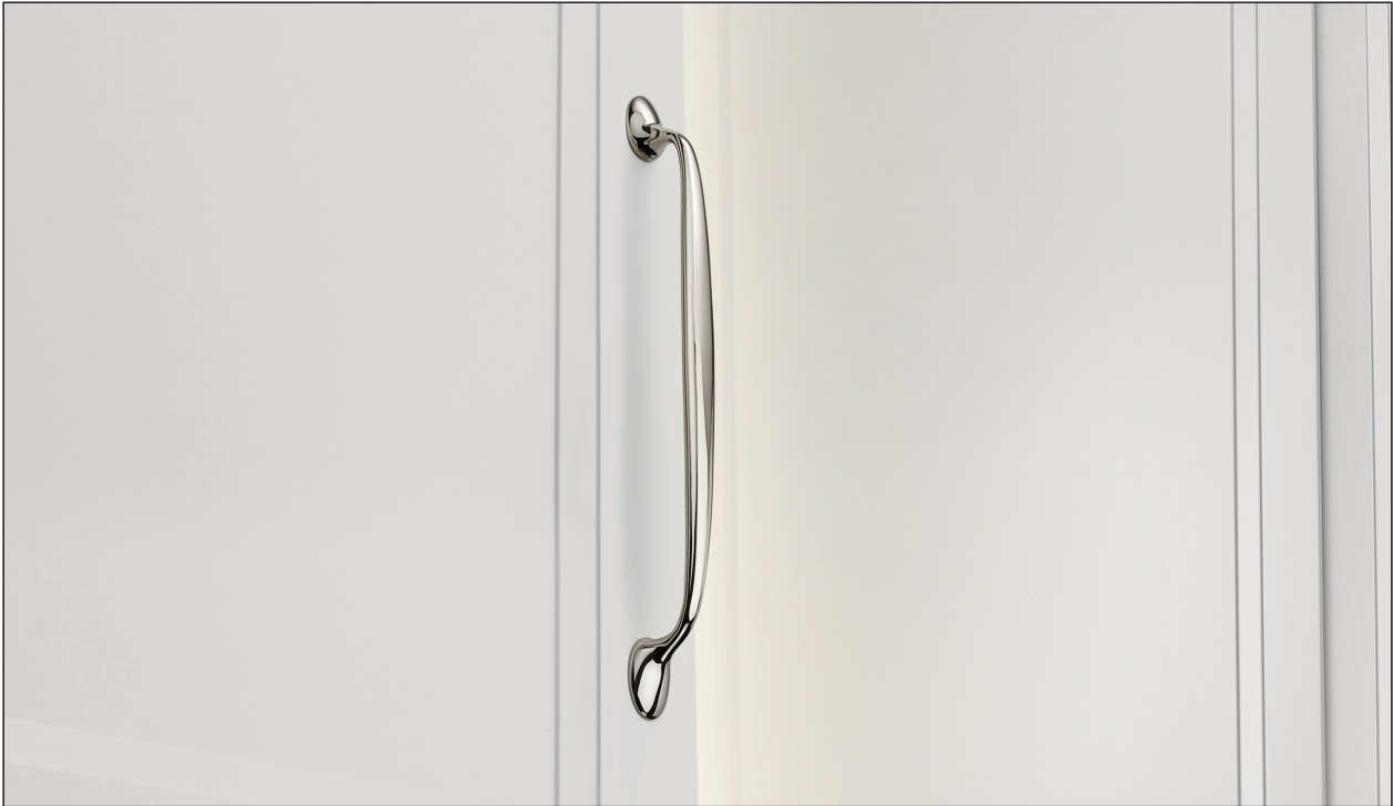
Polished Nickel (Finish ID : 8)