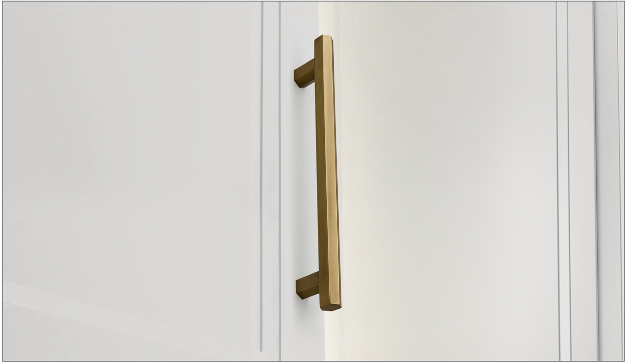
Aged Brass (Finish ID:4)