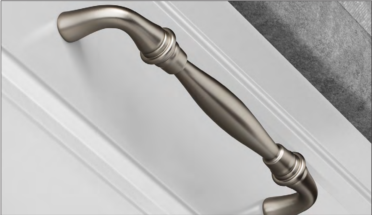
Brush Nickel (Finish ID : 3)