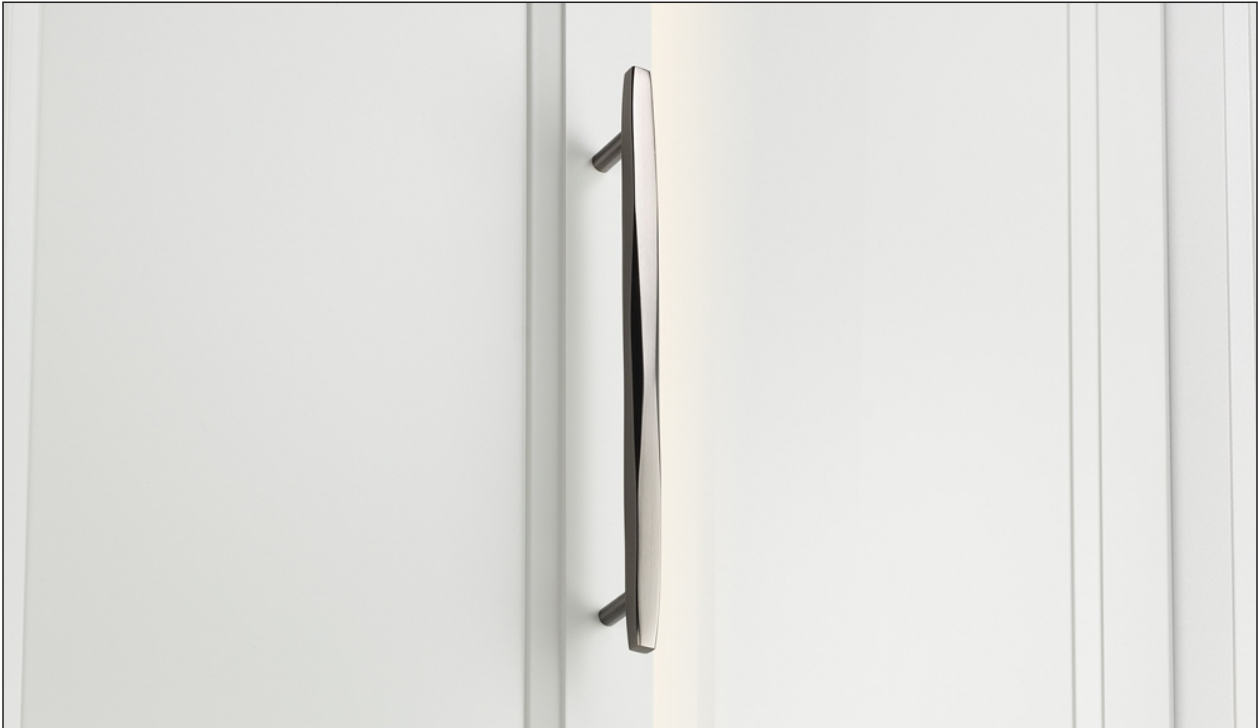
Titanium (Finish ID:79)