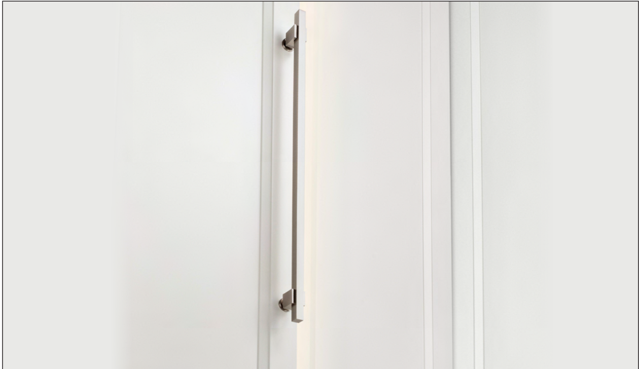
Brush Nickel (Finish ID : 3)