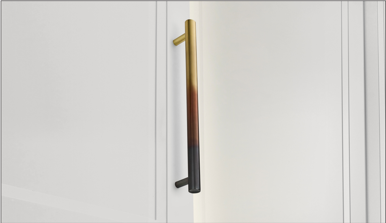
Ombre (Finish ID:92)