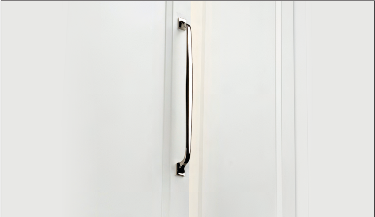
Polished Nickel (Finish ID:8)