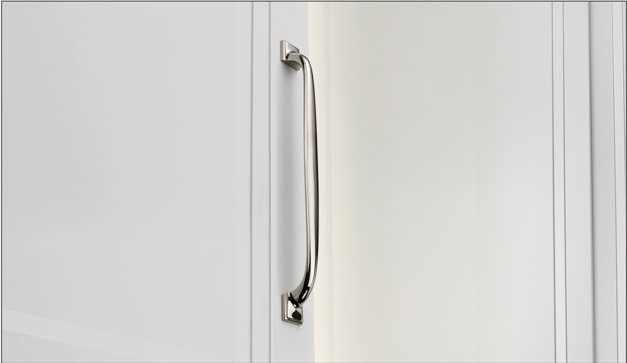
Polished Nickel (Finish ID:8)