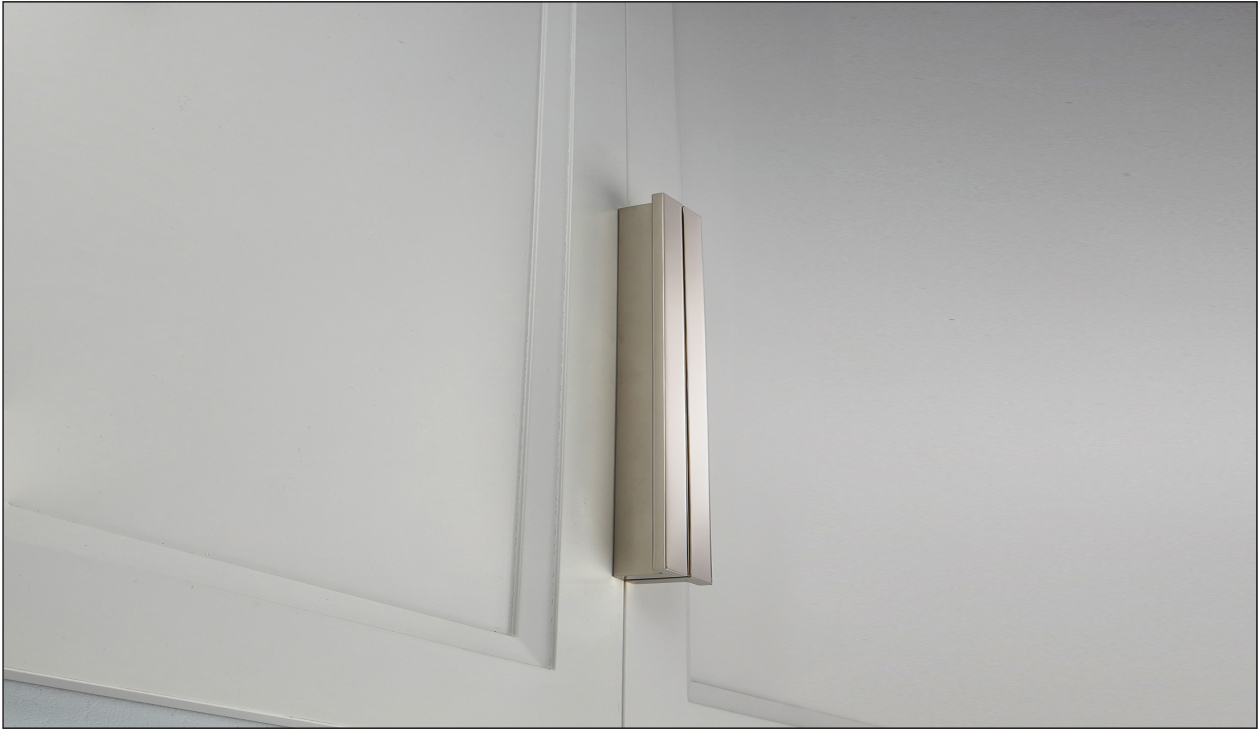
POLISHED NICKEL (Finish ID:8)