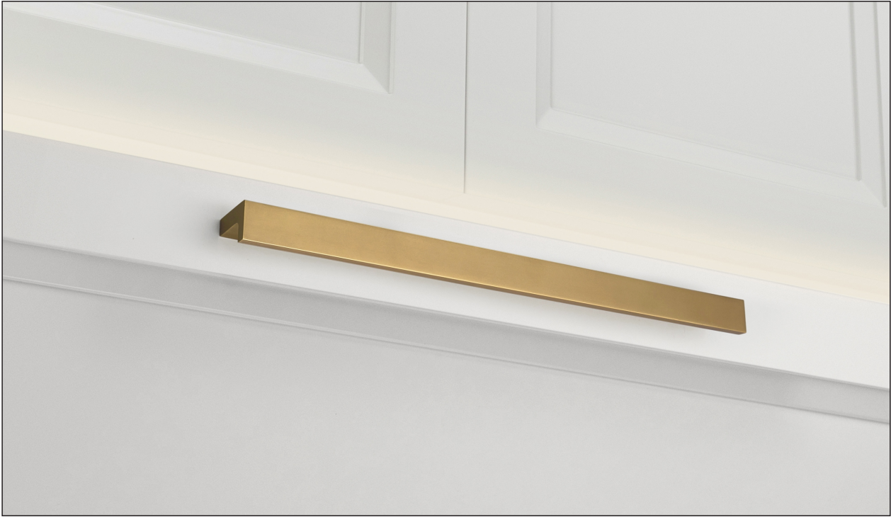
Aged Brass (Finish ID:4)