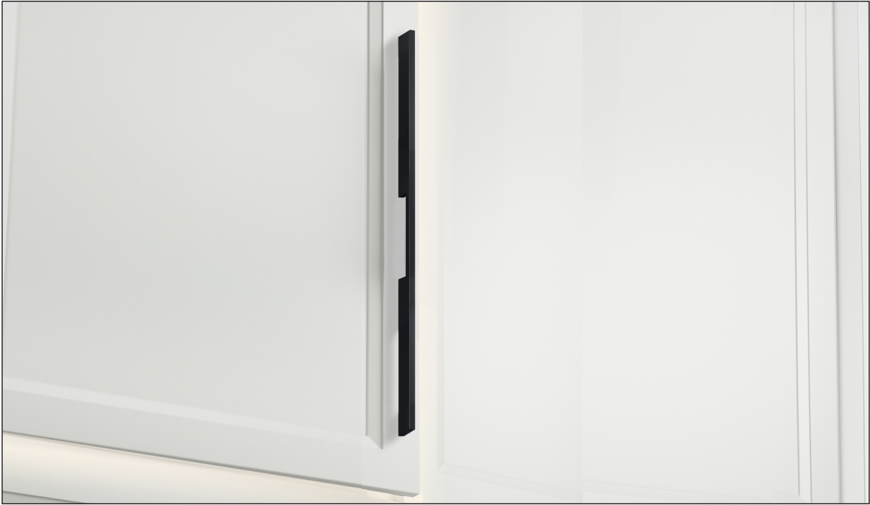
Matte Black (Finish ID : 19)