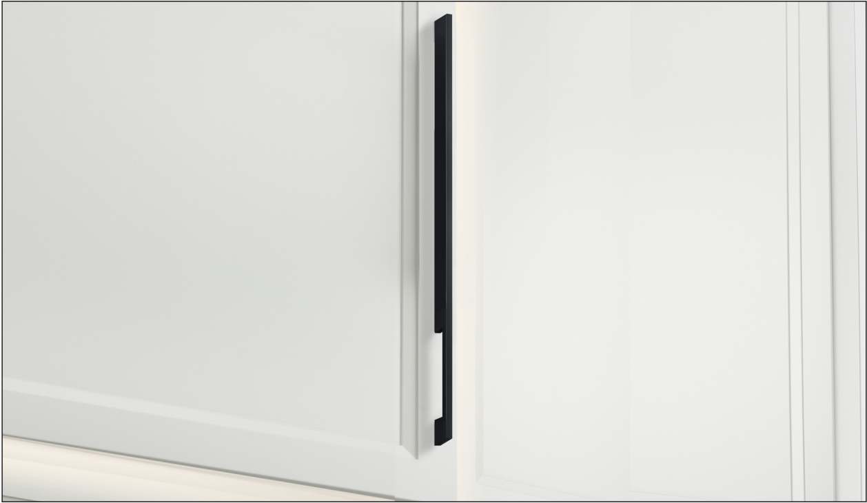
Matte Black (Finish ID : 19)