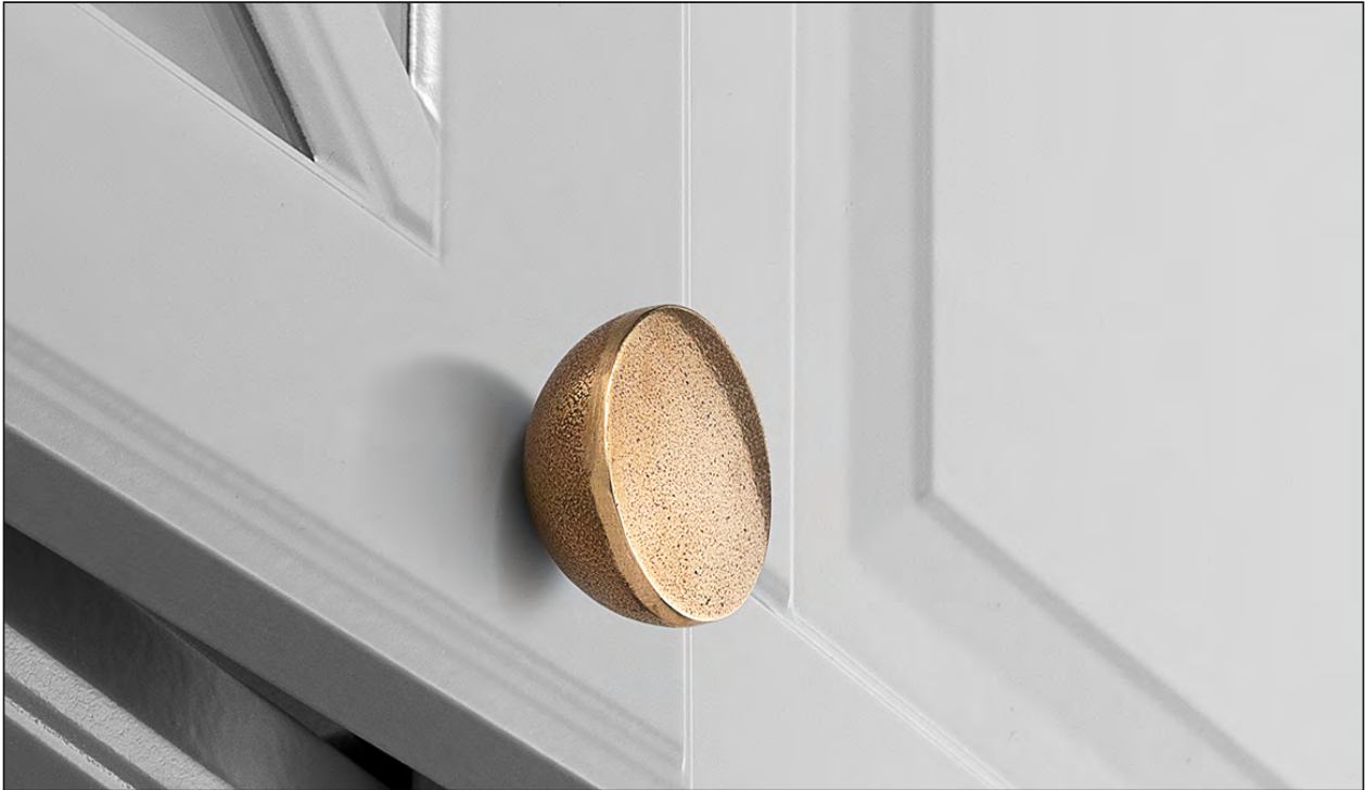
Silicon Bronze Light (Finish ID : 53)