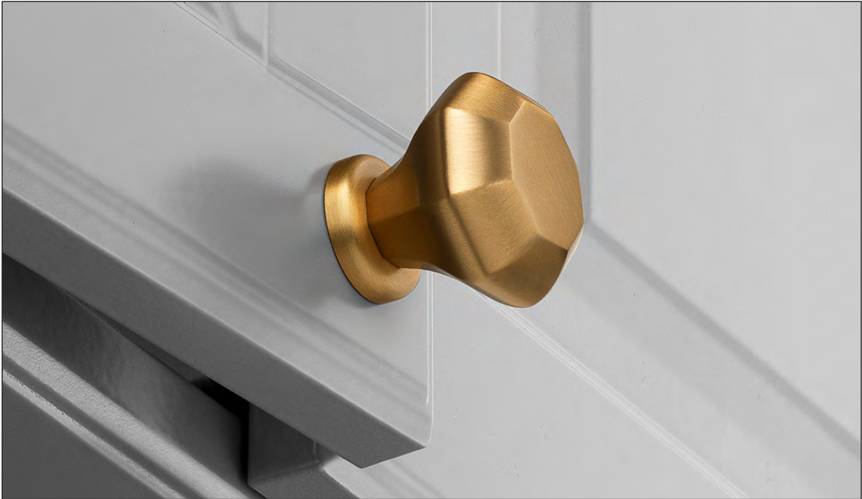
Satin Brass (Finish ID : 13)