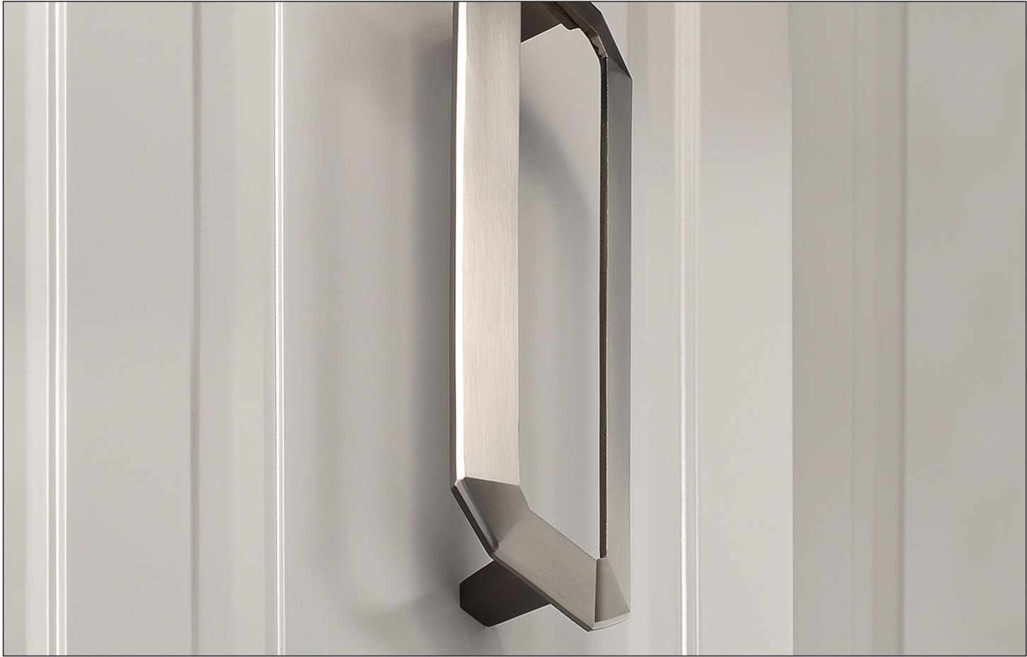
Brush Nickel (Finish ID : 3)