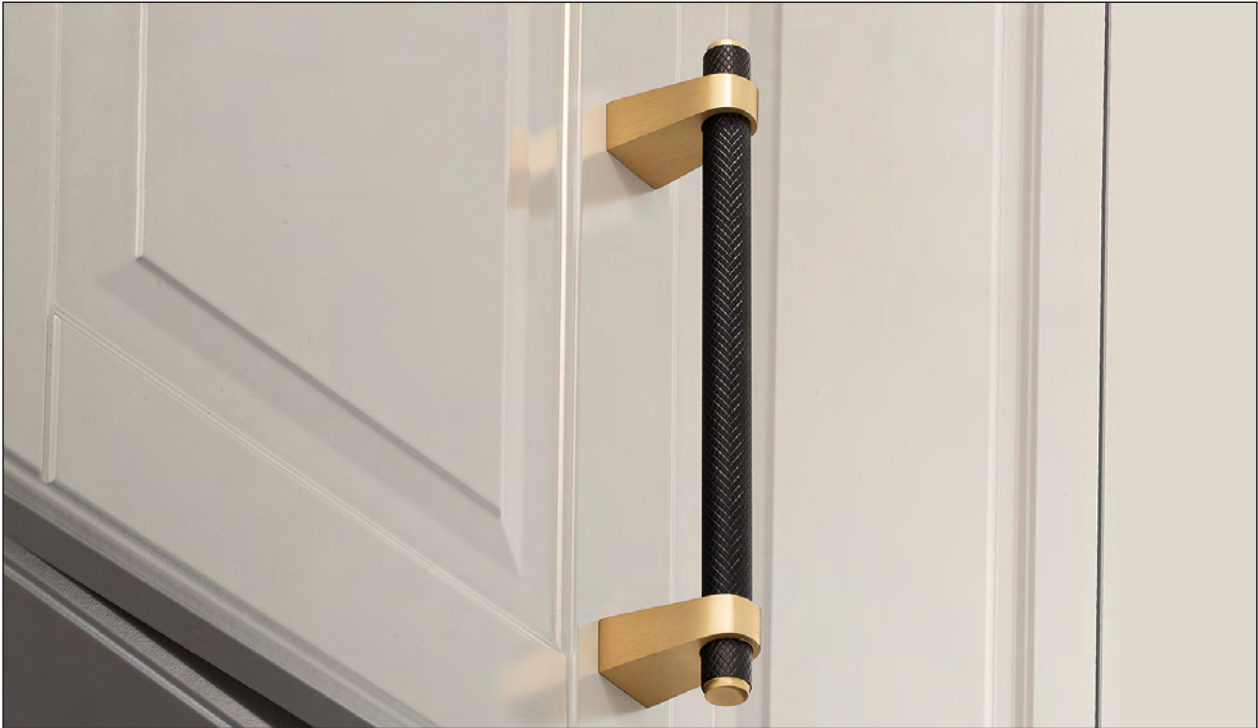
Split Black and Brush Brass (Finish ID : 49)