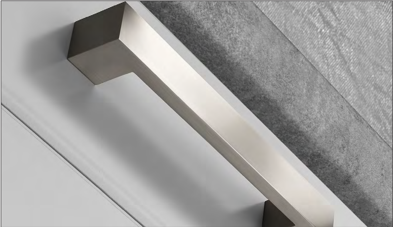
Brush Nickel (Finish ID : 3)