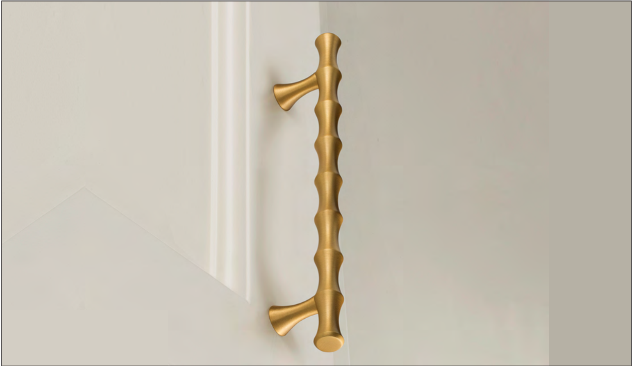
Satin Brass (Finish ID : 13)